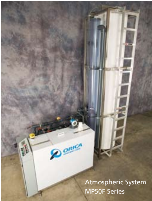
Atmospheric System MP50F Series