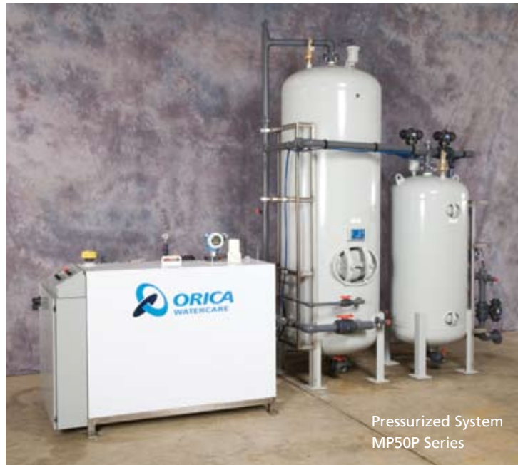
Pressurized System MP50P Series

The MAGNAPAK® System is a packaged ion exchange system that uses MIEX® Resin to remove targeted species from water and wastewater streams.