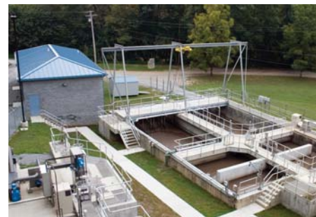
Municipal Wastewater Treatment Huntsville, TN - 300,000 gpd (1,136 m 3 /d) ADF† Packaged Equipment Skids Z-MOD L