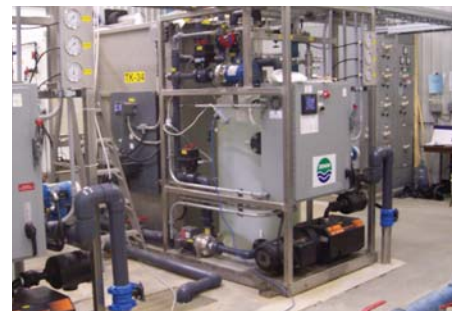
Municipal Drinking Water Township of Tay, ON - 70,000 gpd (265 m 3 /d) ADF† Z-BOX M