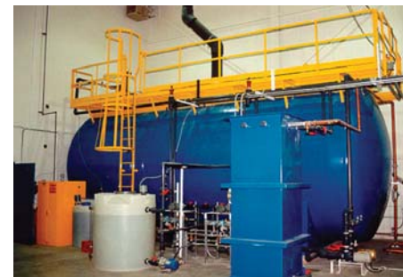
Decentralized Treatment Office Park, Oakville, ON - 17,500 gpd (66 m 3 /d) ADF† Z-MOD S