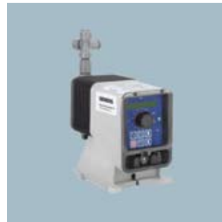
Mega and Micro Series