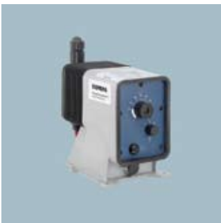
Mono, Econo, Mini, and Mini-DC Series