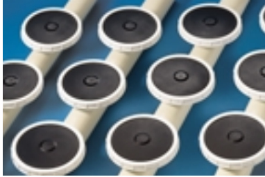
Typical FlexDisc installation.

FlexDisc is your best choice for new diffusion aeration installations utilizing fine bubble membrane technology. Its innovative design is undoubtedly the most efficient and cost effective diffuser of its kind...a real advancement in membrane diffuser engineering. In addition, FlexDisc has been designed for quick and easy retrofitting of existing diffused aeration installations to increase performance and decrease utility costs. USFilter also offers full technical assistance and complete piping systems for new or retrofit installations.