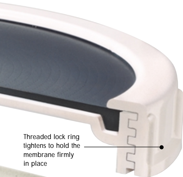
Threaded lock ring tightens to hold the membrane firmly in place

drain the tanks, hose and spray with dangerous acids or use gases for cleaning. FlexDisc with its smooth outer surface, uniform bubble distribution and continuous flexing of the rubber membrane eliminates build up of any type, thereby assuring a lifetime of efficient, maintenance free performance.